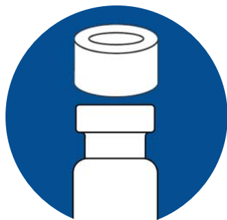
11mm crimp cap with crimp-neck vial