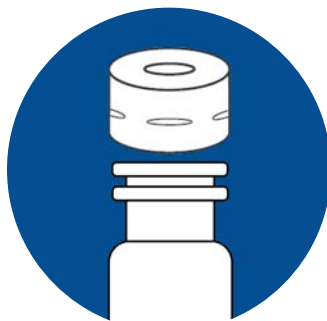
11mm snap ring cap with snap ring vial